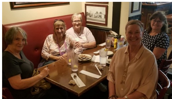
Wednesday afternoon Sewcial at Crystal Beer Parlor